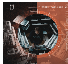
MOOG PROJECT APRIL 2023