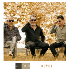
MLB TRIO BIRKA NOV 2021