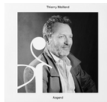
ASGARD SEPT 2023