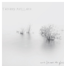
UNE LARME DE PLUIE SEPT 2022