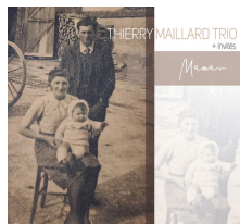
MAMAN JAN 2024