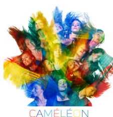
ENSEMBLE CAMÉLÉON MARCH 2022